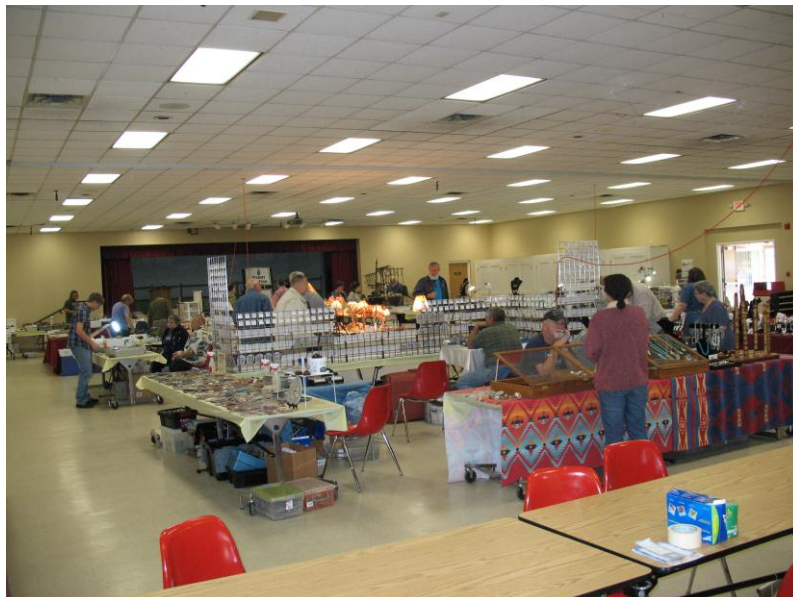
Just before we opened the doors.

Thanks to all the people who helped to make this show a success. It was a lot of work to make the show a fun experience for adults and children. We will be looking at other locations for next year's show including the current location for our club meeting at the church. The main reason to change is because we need extra space for the vendors who we lost to the 2011 FossilFest (the fossil show for 2012 is the end of March).